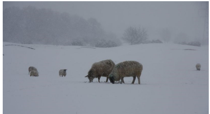
Sheep in Great Denham