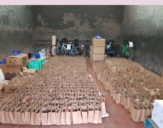
NHS staff goodie bags

Earlier in the pandemic our community worked together to provide both patients and NHS staff at Bedford Hospital with goodie bags. Well done all those involved!