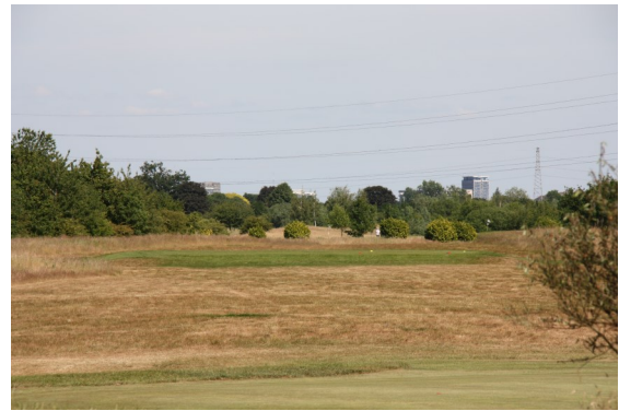
View across the Golf Course

If you have any photos of Kempston or Biddenham, send them to stjameschurchbiddenham@gmail.com